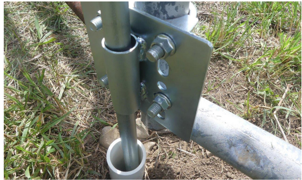
The lower bracket provides the extra support needed to keep livestock secured.

To control livestock, you need gate hardware that has purpose-built design and is rugged enough for serious pressure from animals. Our design includes 3mm thick stamped and precision welded brackets with a corrosion and rust resistant 96-hour salt spray rated zinc electroplate finish. The rod is 24" long and a very robust 20mm (nominal 3/4") diameter, strong enough to keep the most rambunctious animals contained. The set installs without welding, a combination wrench or ratchet does the job in just a few minutes. The brackets have been punched so the clamps make a perfect fit on 1 1/2", 1 3/4", or 2" tubular steel vertical or horizontal farm gate members. In addition, there are ample round holes for mounting to wood posts or gates. The clamps have been custom manufactured with a flat inside radius so that they make maximum contact and grip on tubular steel gate members without crimping or crushing.