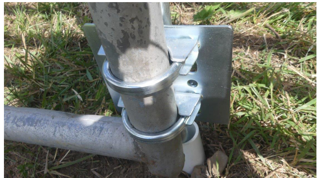
2 clamps on each bracket insures a solid connection. The clamps have a flat inside perimeter so that they make a secure connection to the gate tubing without pinching.