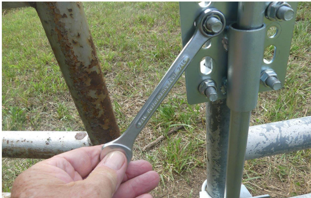
No welding - installs in minutes with a wrench or ratchet